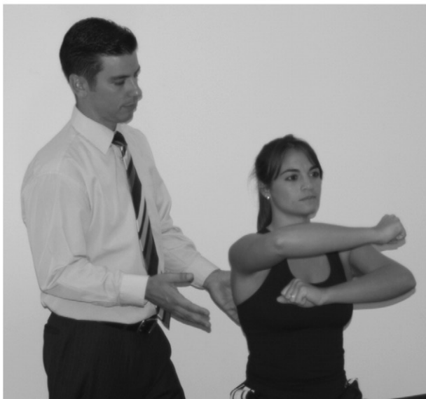
Fig 3. A, Combination of the Hautant test and drift test. B, Dizziness test. C, Arm rolling test.